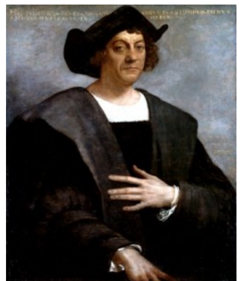
Posthumous portrait of Christopher Columbus.

1. While Columbus played a major role in rooting Europe into North and Central America, he was not the first European to discover America. Leif Ericson landed on the northern tip of Newfoundland almost 500 years earlier. Columbus discovered and explored the Bahamas and other Central American areas (graphic of his trips here ). His discoveries were not only five centuries later compared to Ericson, but nowhere near the United States of America that we know today.