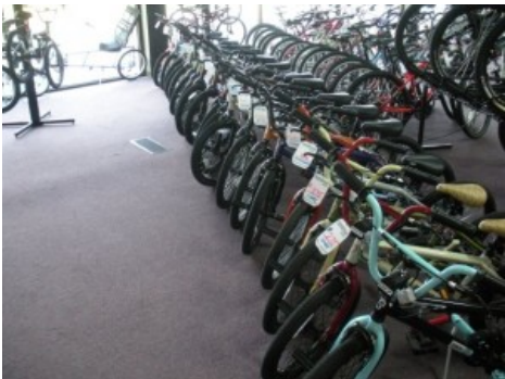
A look at some of the bikes at Yesteryear.

popular with the Baby Boomers. Now, the Pedal Forward bikes, where you sit lower to the ground and the pedals are in front of you, are very popular. It's called recumbent riding and is much better for your back. Most doctors will recommend cycling because it is the 2 nd highest calorie burning exercise, next to swimming. It is low impact as well. Due to the bad economy, we see people deciding to ride their bike to work. With the price of gas, it saves money while being a healthier alternative, plus it's good for the environment.