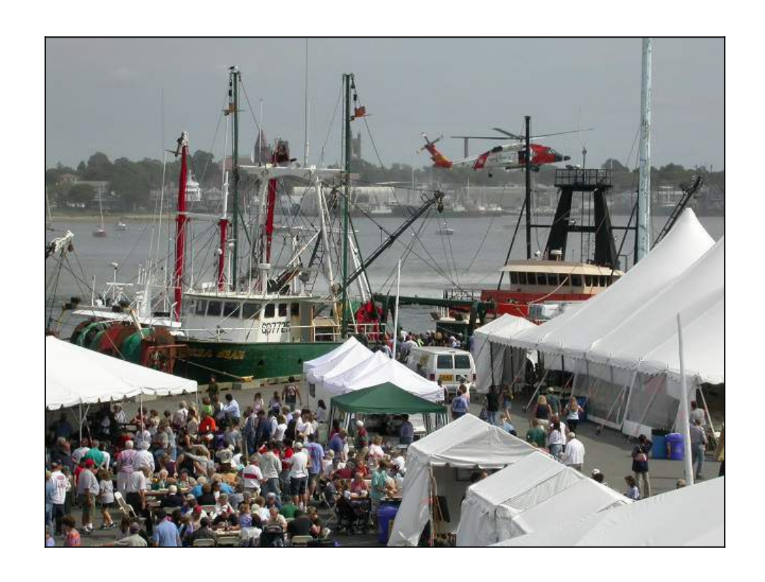
Working Waterfront Festival set for September 28-29