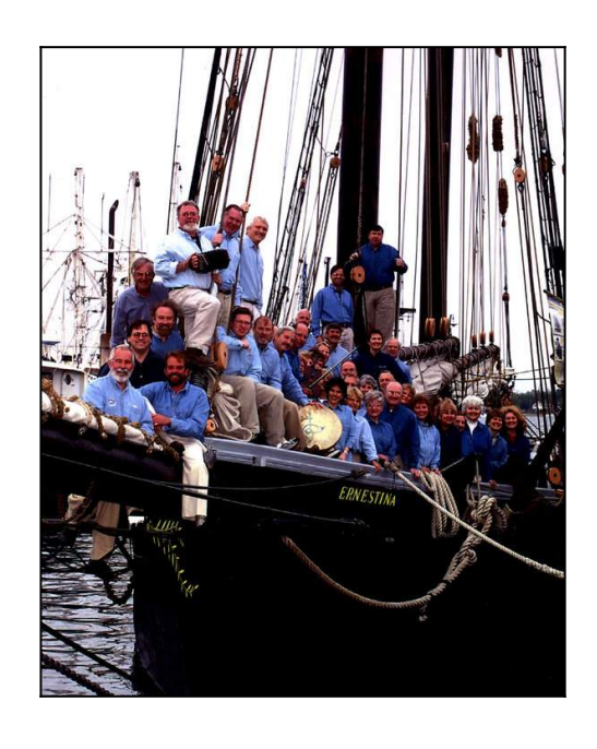
Get a deck tour on the Ernestina!

Don't miss the opportunity to learn about the different types of fishing vessels first-hand by getting on board one or more of the vessels offering dockside tours and talking with the crew. Vessels offering dockside tours include: a scalloper, a steel dragger, a deep sea clammer, a Stonington dragger, and a tug boat.