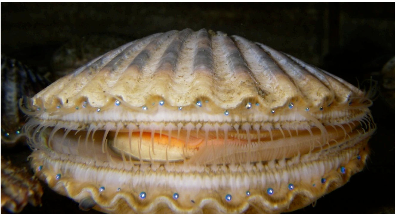
Live scallop in its natural habitat.

Once again we would draw a crowd from the region and beyond, bringing in revenue and a boost to local businesses as visitors explored the rest of the city, enjoying and exploring all the New Bedford has to offer. How about it New Bedford?