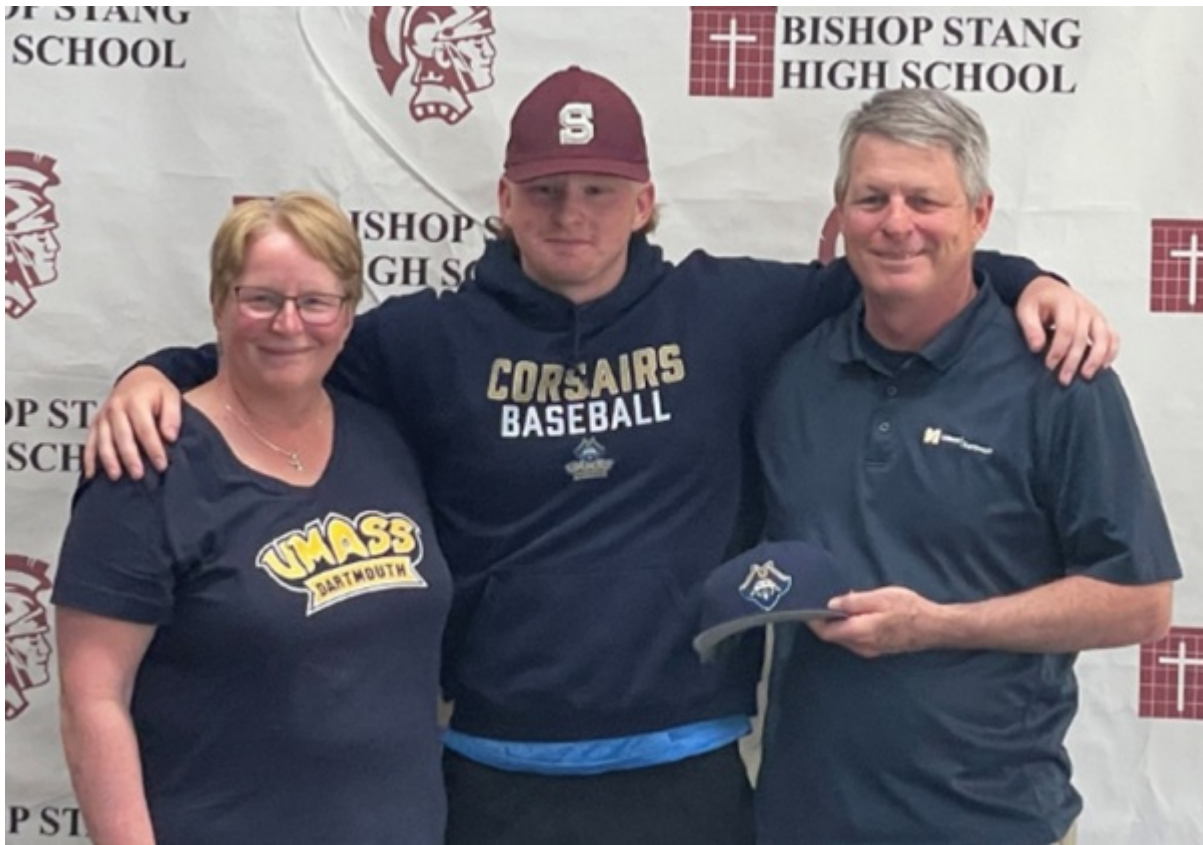
Bishop Stang High School photo.