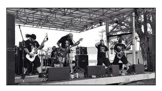
New Bedford based Goreality

Bullpen and Marshall's Pub when business went sour for the New Wave.