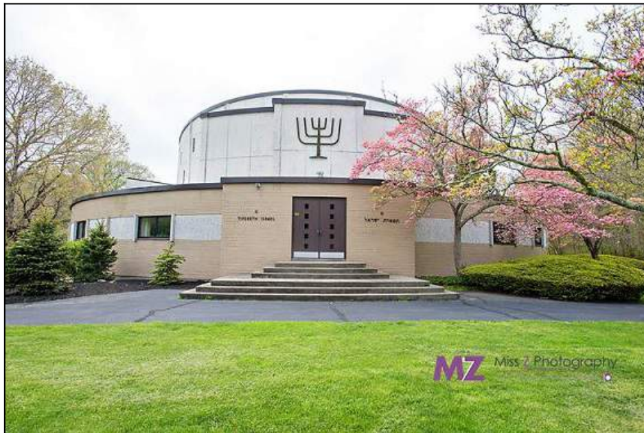
Established in 1922, Tifereth Israel's building was dedicated in 1966.

Sholom is a Hebrew word that many understand to mean "peace." However, this base definition fails to truly convey the living concept behind the term. It's one we see in movies or perhaps see two Jewish people utter to one another as a blessing or greeting.