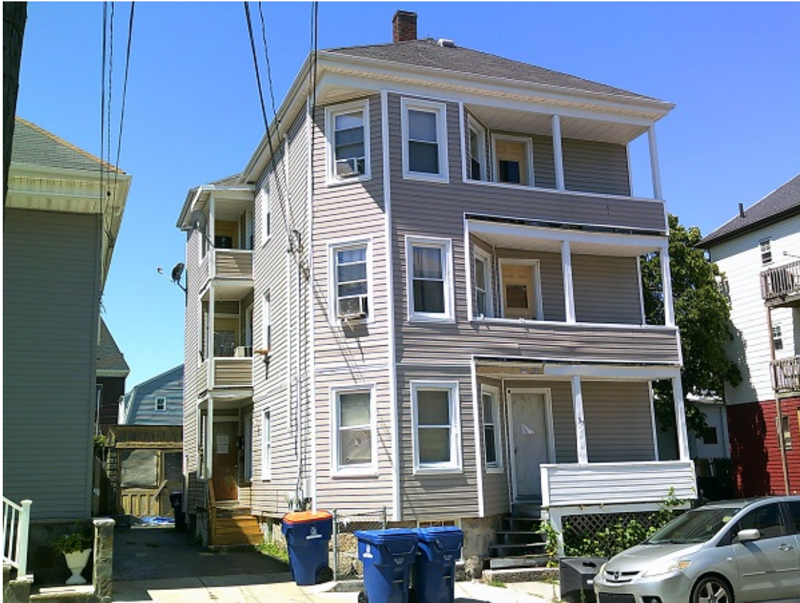
37 Ashley Street New Bedford.