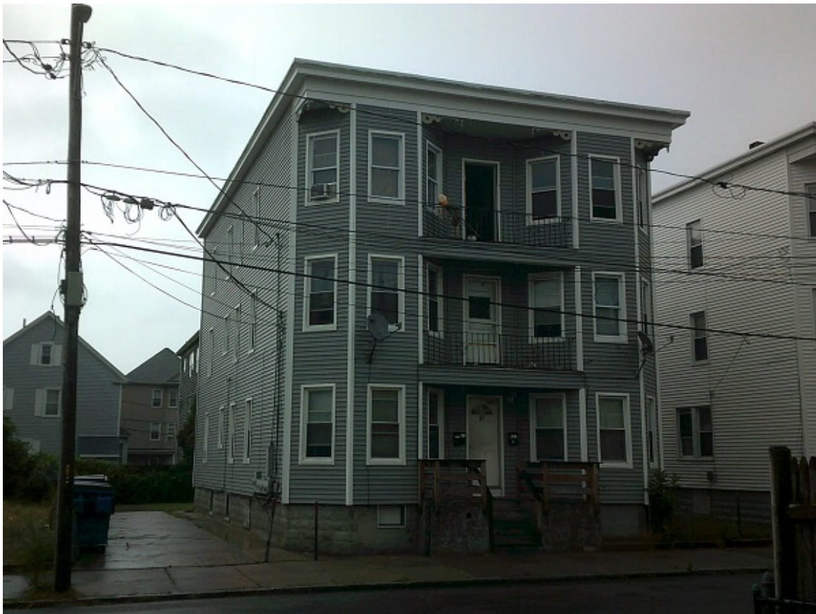
50 Ashley Street New Bedford.