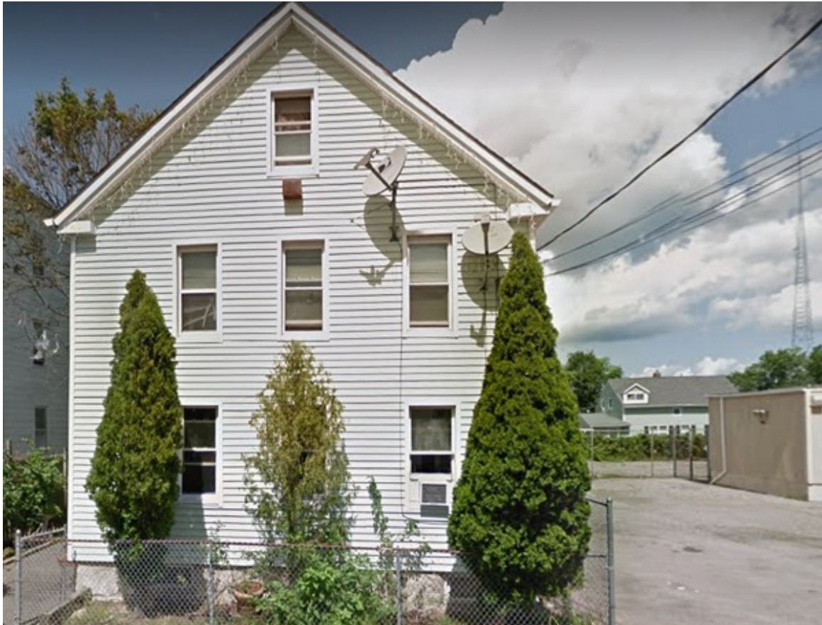
43 Division Street New Bedford.

The second worst street in the south end was Division Street with three people arrested for drugs living on the street. The people arrested for dealing live at 43 (two roommates) and 195 Division Street. Charges include Class E drug or fentanyl distribution.