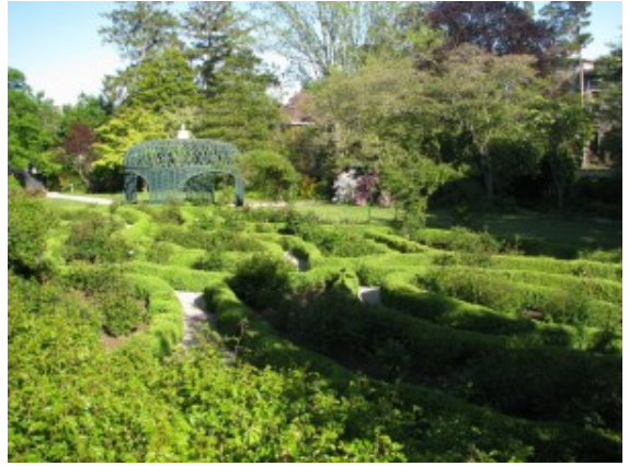
The gardens at the Rotch-Jones-Duff House.