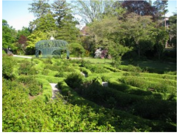
The gardens at the Rotch-Jones-Duff House.