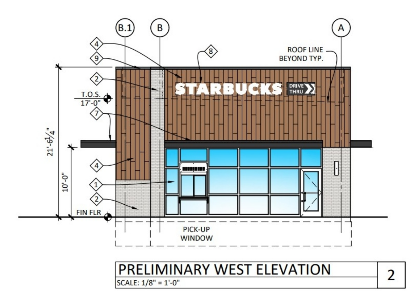
Hilton Displays