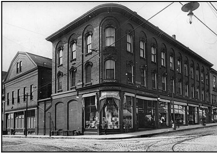
New Bedford Dry Goods' Star Store circa 1916