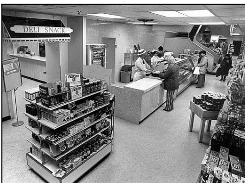
Deli Department 1975

Almy's was purchased by Stop & Shop in 1985 who held a liquidation sale (at the New Bedford site) before closing the doors permanently on January 12, 1985. In November, it re-opened as Stuart's employing 175 people. Continuing the theme of musical businesses Stuart's closed its doors in 1987, and moved to the North End. The building was officially vacant and began to deteriorate to the point that the facade was falling onto the sidewalks and street and the city had to erect a covered walkway. Thieves began to strip the building of its copper flashing.