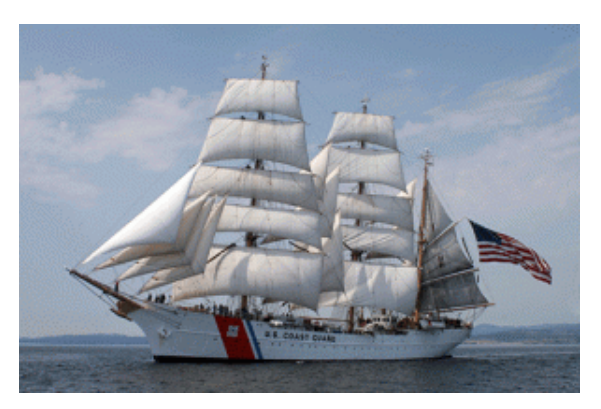
U.S. Coast Guard's ship Eagle FREE public tours are Friday, Saturday and Sunday

Start the morning with some exercise. Try out a yoga class at Yoga On Union (corner of Johnny Cake Hill and Union St.). Saturday morning offers two classes; 8am-9:15am or 9:30am-11am. Cost is 5 classes for $60, 10 classes for $110,