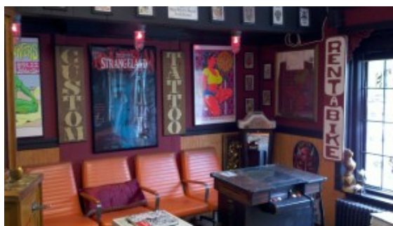
Another from inside Sinners & Saints.

Like I said I always use to go to these types of events with my father and I absolutely loved it. I have been involved with bands and touring and putting on events for most of my life. I use to tour and work with bands like Twisted Sister (D. Snider), and Penny Wise in Canada. Playing to over 12,000 people; now that was a blast.