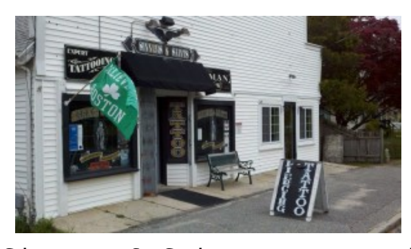
Sinners & Saints was named after a bar that appears in the Punisher comic books.

So you went from the band stuff, to hauling planks in the snow, to opening up your own tattoo parlor. May I ask what your education is?