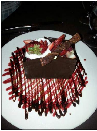
The glorious "Chocolate Bag"!

Here was another theme threaded throughout the Seafire experience: don't oversalt and oversweeten the ingredients. Let the quality and freshness of the ingredients combine with the chef's ability stand on its own. It's an insult to add copious amounts of salt and sugar to ingredients. In my opinion, it's what poor chefs hide behind.