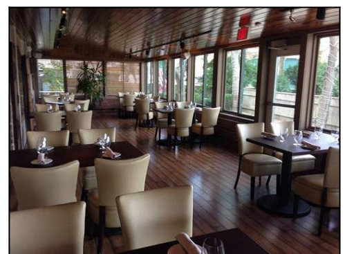
The patio – one of three seating areas plus the rectangular