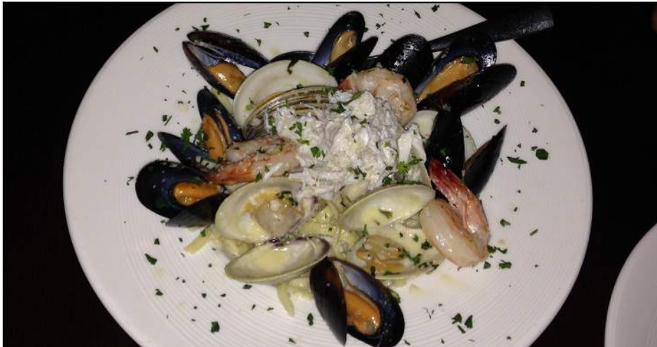
My Seafood Delight: "Littlenecks, Mussels, Scallops, Shrimp and Lump Crab Meat in White Cream Sauce, Marinara Sauce or White Wine Sauce Over Fresh Linguini."

I won't beat around the bush. I won't lead you on a vague trail of allusions keeping you guessing as you read. I'll be transparent as possible and state that last night I had one of the best meals in my life.