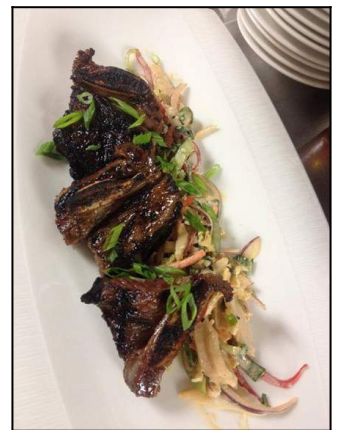
Asian Short Ribs – Served with Soba Noodles and Grilled Vegetable Stir- Fry.

The pricing of the menu is spot on for what you are getting. Yes, some people wouldn't be able to afford it on a regular basis, but they would certainly make Seafire their destination for a special night, like an anniversary, birthday, or work promotion. Having said that, Seafire is not a pretentious, arrogant high-end restaurant.