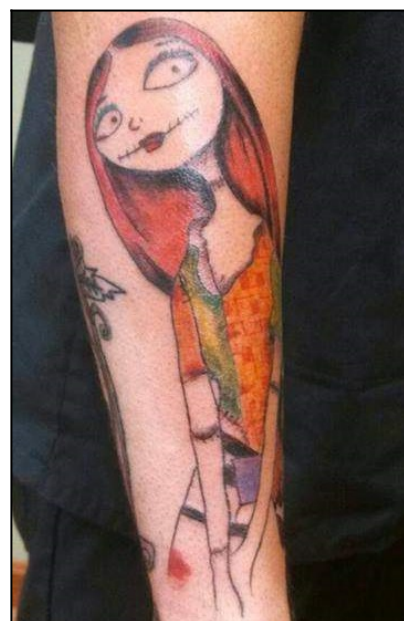
Ruby Red Ink has a

In fact, I believe it's human nature. People are always chasing the next rush or buzz – even though they are painful experiences and will probably lead to injury or potentially death. We climb mountains, jump out of planes, do Tough Mudder events, take up martial arts, etc. These outlets serve society in that these activities serve as an outlet, and for some they would be using other outlets to get their rush or buzz – namely criminal or drug-related behavior. Life can be all the high you need.