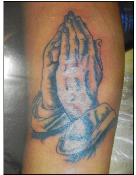
Praying hands tattoo

sterilization, getting the tattoo, sign paperwork and get any questions or concerns they have answered. We want them to be as physically and mentally as possible.