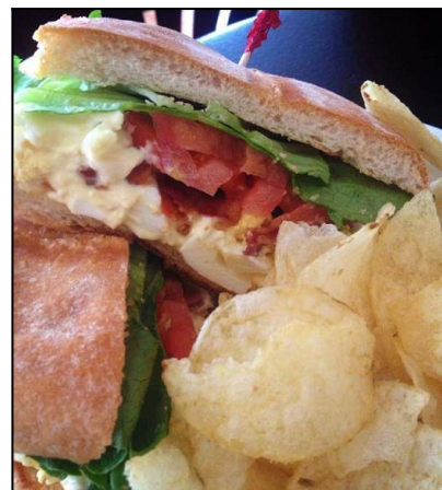
Tia Maria's European Cafes BELT: Bacon, Egg Salad, Lettuce & Tomato!

offer outside seating, and I was able to indulge in great food from another culture especially when I tried their Turkey Reuben with their own homemade dressing.