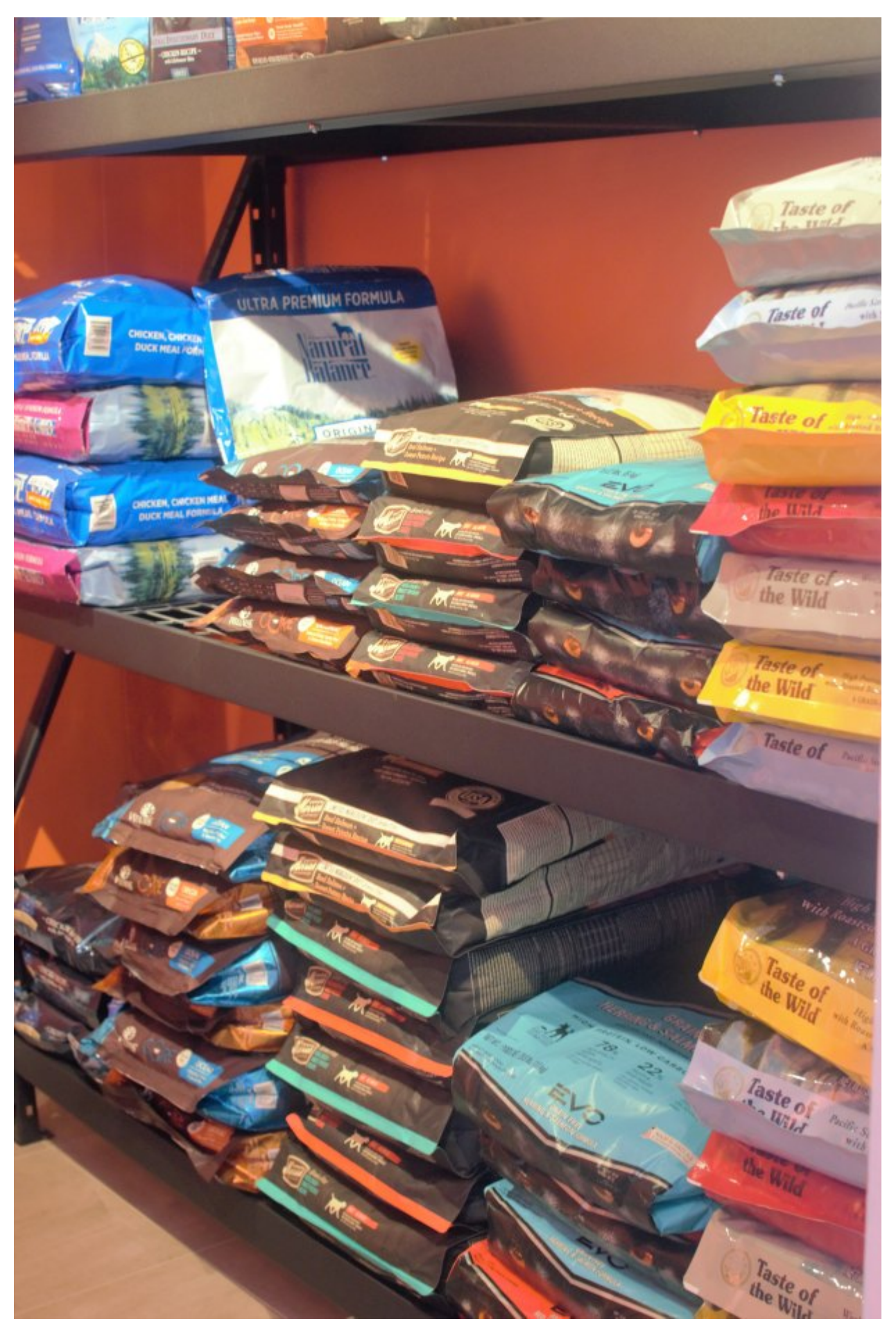
What I haven't seen is a self-service dog wash and boutique.