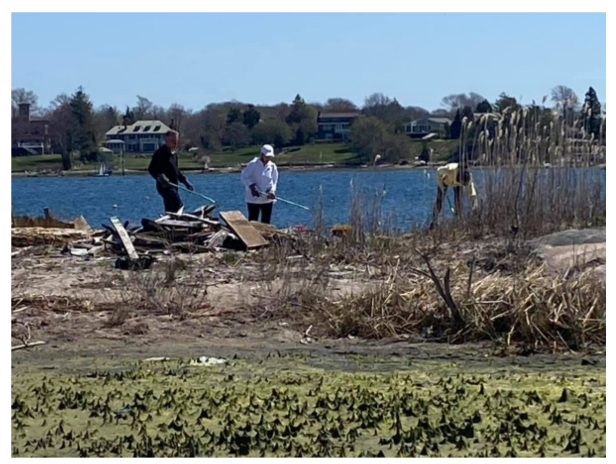
Operation Clean Sweep photo.