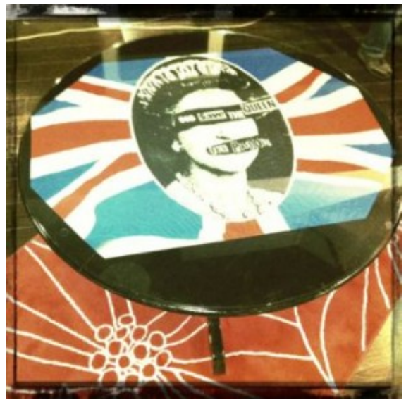
Sex Pistols Table

767 Exchange offers clothing and accessories for both men and women and is more contemporary than your regular thrift store. Our prices range widely depending on the label, style, condition and other factors. Many items average around $20.