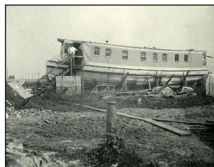
Man and woman standing at the entrance to their house built out of the hull of a ship.

This had little to no effect since a plan was derived to rid the town of the Ark once and for all and the folks were determined to stick with it. To complete what the first mob did not. At 9:00 p.m. that evening a mob formed. Part of the mob consisted of fire department officials as evidenced by the presence of a hook and ladder truck and the eyewitness report that stated "...25 men, distinguished by their uniform coats turned inside out, trousers covered in white canvas at the knees, and slouch hats."