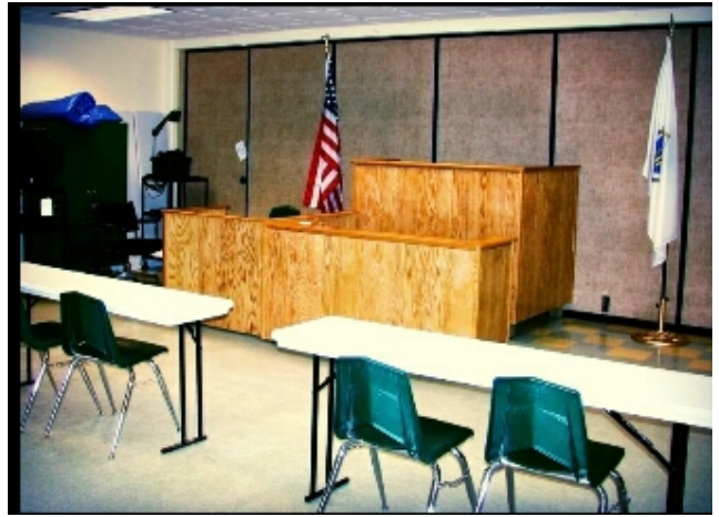
New Bedford Youth Court

Sanctions are the punishments the respondent or “client” receives for his or her actions. Sanctions range anywhere from community service – which every respondent receives at least 8 hours of – serving on the youth court jury (which every respondent over the age of 12 receives), essays, apology letters, boot camp, counselling, mandatory programs, curfews, house checks and even some extreme ones like drug tests and no-contact orders.