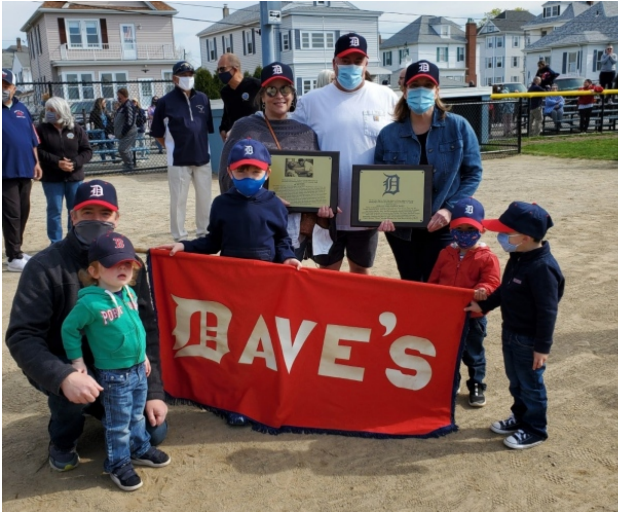
Whaling City Youth Baseball League photo.