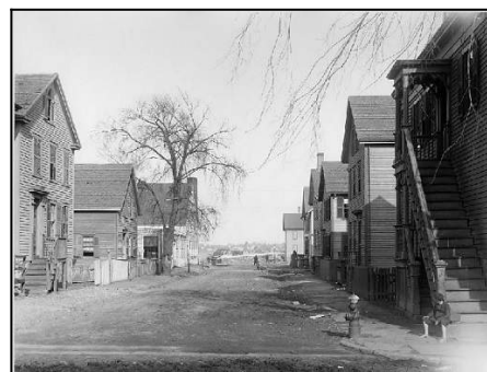
Washington and North First Street circa 1895.

As usual, I'd like to re-iterate the importance of reader feedback, correction, and contributions. In the process of exploring these streets, I try to confirm or validate statements and dates by finding multiple sources. Unfortunately, if all those sources are making their statement based on an older, incorrect source, and there isn't any dissenting information available, there's no way to know otherwise. So by all means, please join in.