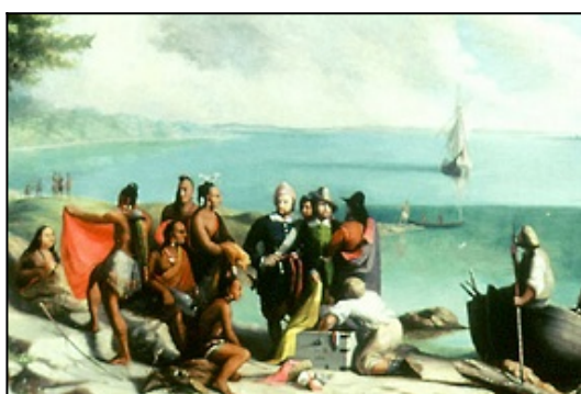
1602-Gosnold at Smoking Rocks

The history of William street goes back before the history of New Bedford as a city or even a town. It also begins, as is often the case with the origins of New Bedford with the Russell, Kempton and Allen families. We'll get to them in a moment. Let's set up our series.