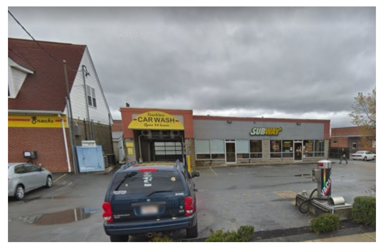
Hilton Displays, City of New Bedford photo.