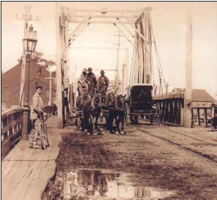
New Bedford/Fairhaven Bridge in the 1800s.

old. Alas, it lasted only 8 years before heavy winds blew it down.