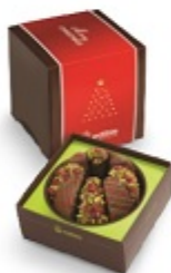
Merry Christmas Caramel Apple - 'Tis the Season $49 Product #: 4040