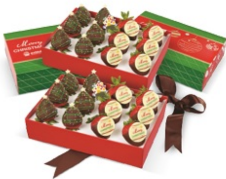
Very Merry Christmas Tree Berries™ $55 | $110* Product #: 3970