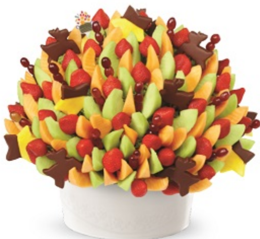
New! Season's Greetings Party™ $109 | $139 | $179 | $209* | $239 | $269 Product #: 4673