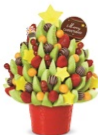
Christmas Tree Bouquet™ $85 | $105 | $125* Product #: 4712