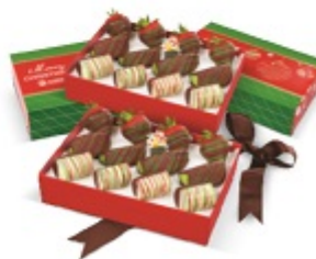
'Tis the Season Swizzle Trio® $46 | $92* Product #: 4691