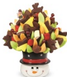
Season's Greetings Celebration™ Dipped Bananas & Holiday Swizzle Berries® $100 | $122 | $144* Product #: 4672