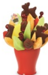
Season's Greetings Daisy with Holiday Swizzle Berries® $59 | $67* Product #: 4668