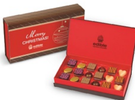
New! Merry Christmas Edible® Signature Chocolate Box 18-piece: $57* | 36-piece: $114 Product #: 4723