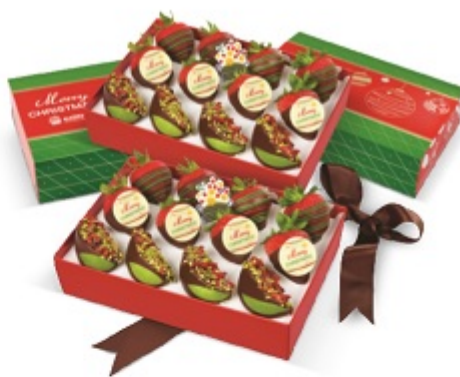
Joyous Christmas Dipped Fruit™ Box $55 | $110* Product #: 3978