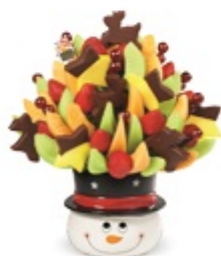
Season's Greetings Celebration™ $75 | $95 | $115* Product #: 4669