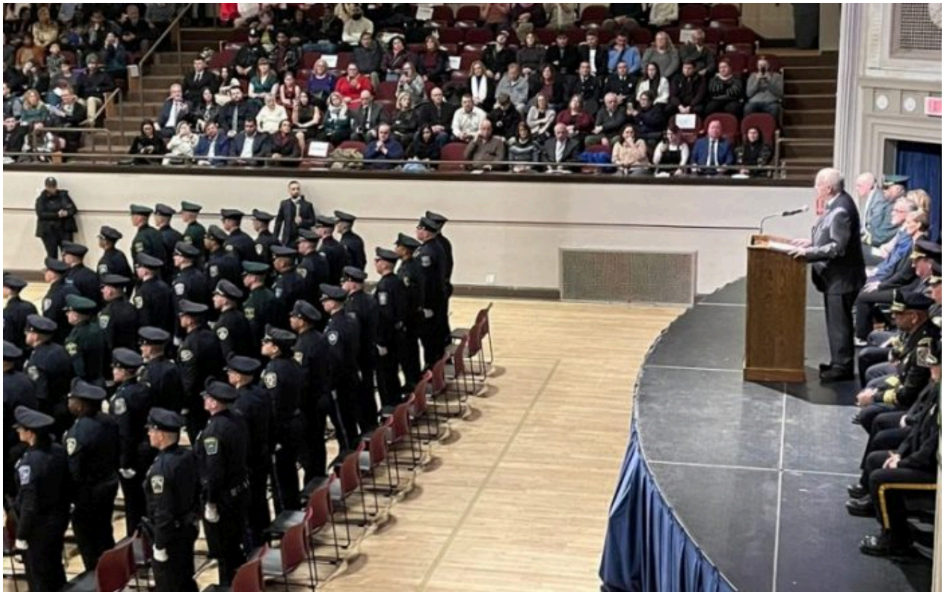
Administering the Oath of Honor to the MPTC Plymouth Police Academy 75th Recruit Officers Class graduates this afternoon at Plymouth Memorial Hall. Congratulations to the recruits and their families. Be safe!