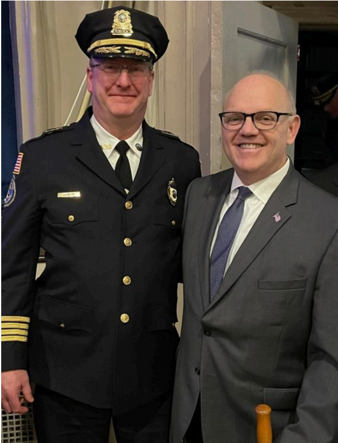
Administering the Oath of Honor to the MPTC Plymouth Police Academy 75th Recruit Officers Class graduates this afternoon at Plymouth Memorial Hall. Congratulations to the recruits and their families. Be safe!