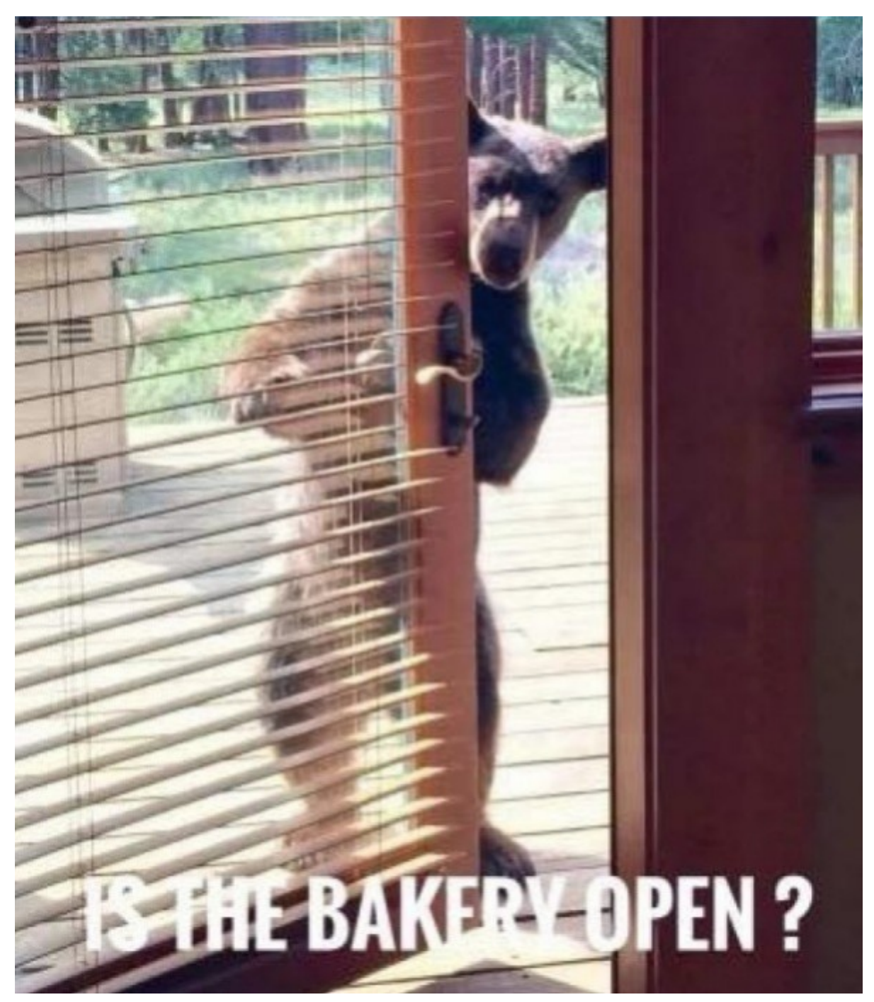
Taste by Spellbound photo.

That's when the worst element of people came out: people wanted a photo opportunity so would pull out their phones and cameras in attempts to snap a shot. One person even filmed themselves chasing the bear down the street in their car.