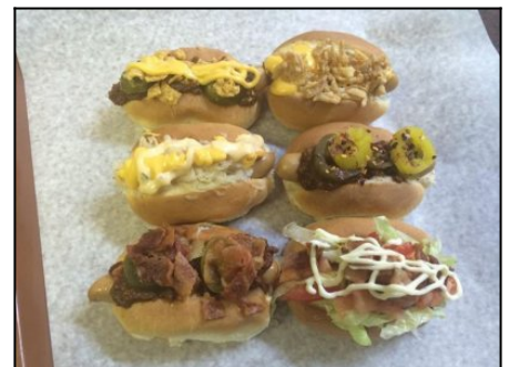
Some signature dogs: