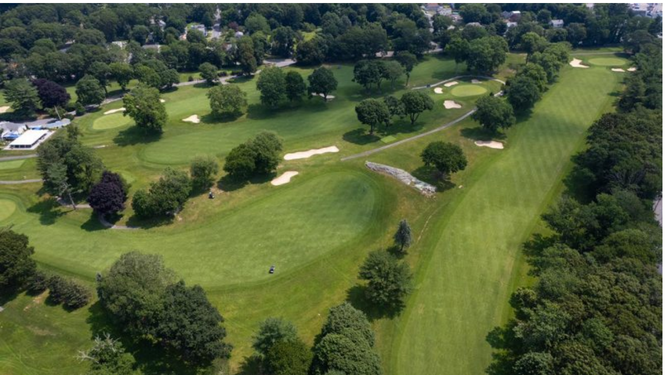
Country Club of New Bedford.