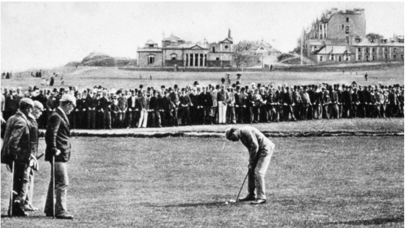
Willie Parker Jr. playing in the Open.

The following month on March 28, 1922, the board proudly announced the official hiring of world renowned golf course architect, Willie Park Jr. This was a huge deal as Willie Park Jr. is the world's first "golf course architect", a two time Open Champion, and the first man ever to write a book on how to play the game of golf.