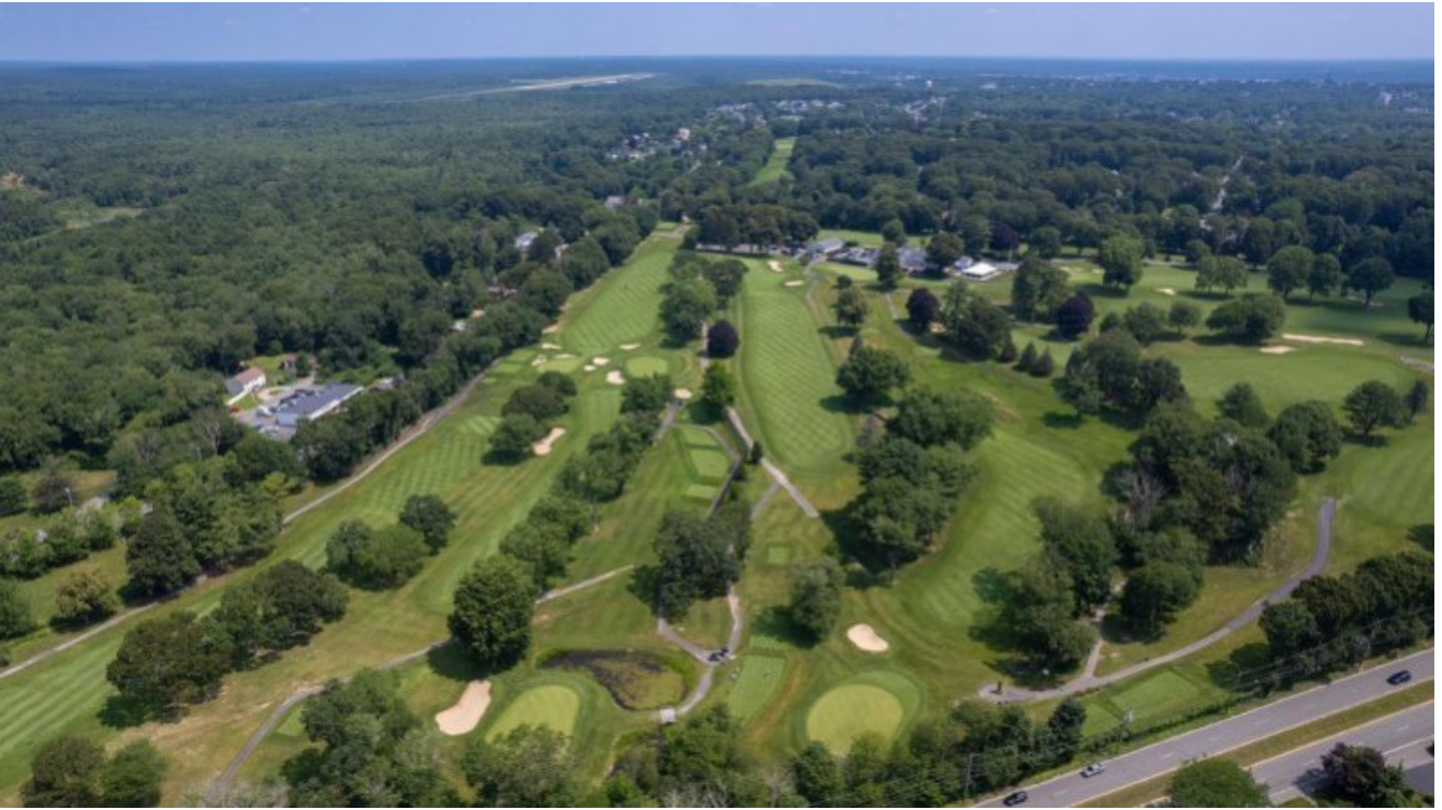
Country Club of New Bedford.