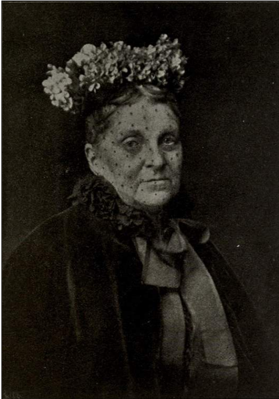
Henrietta Howland Green aka the "Witch of Wall Street" (Wikipedia)