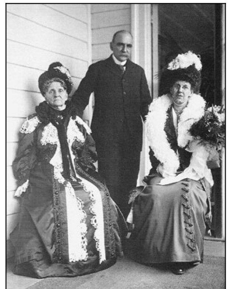
Wedding Portrait of Hetty Green, new husband Matthew Astor Wilks, and daughter Sylvia

by who he was married to, but also because Henrietta was one of those who actually invested in the company. Investors thought that the husband of the richest woman on earth who also had a financial interest, wasn't someone you would have to be concerned about defaulting on a loan on. When the house began to collapse, it was learned that the firm had actually loaned Edward money based on who he was wed to. Her primary bank tried to recover some of Edward's debts by seizing some of her assets. They certainly didn't know who they were dealing with!