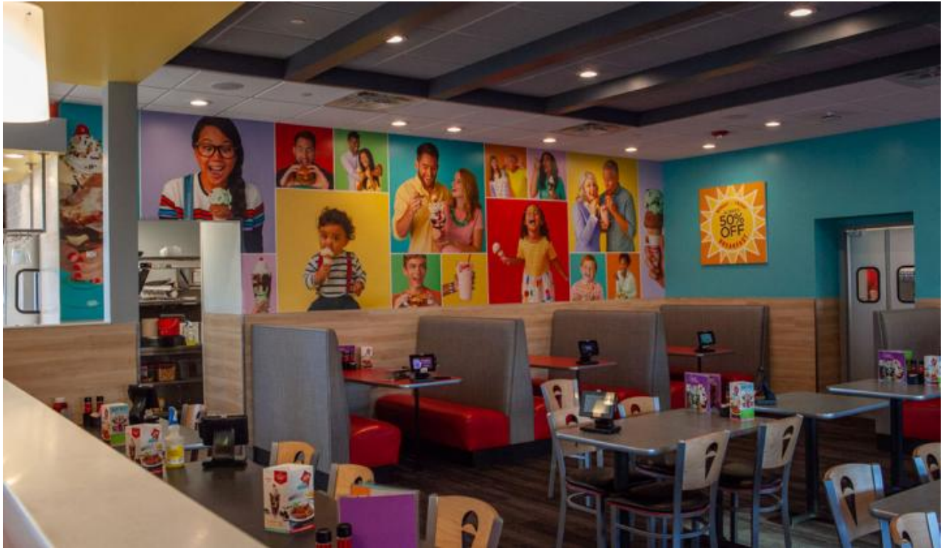
Friendly's Restaurant photo.