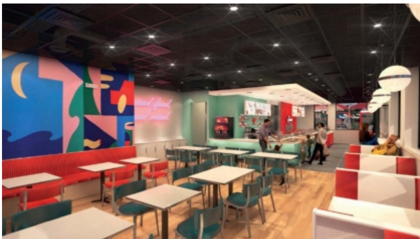
Friendly's Restaurant photo.