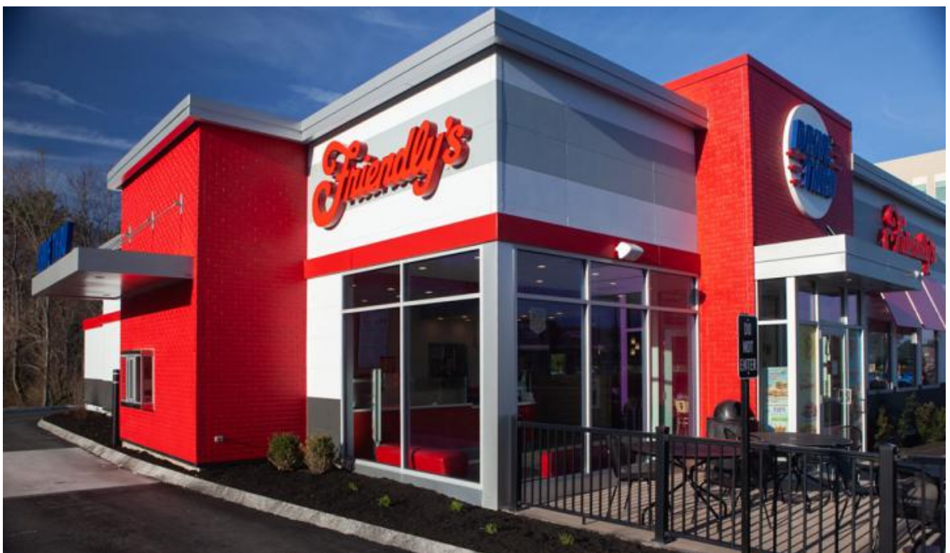
Friendly's Restaurant photo.

Going the route of Dunkin' Donuts which revamped and reinvented their menu, interior, and name, Friendly's new restaurants will be called "Friendly's Café." The Westfield location is slated for an end-of-January or early February grand opening. 45 people will be able to sit in the 2,700 sq. ft. dining room. Four parking spots on the side of the building will be dedicated spots solely for curbside pick-up.