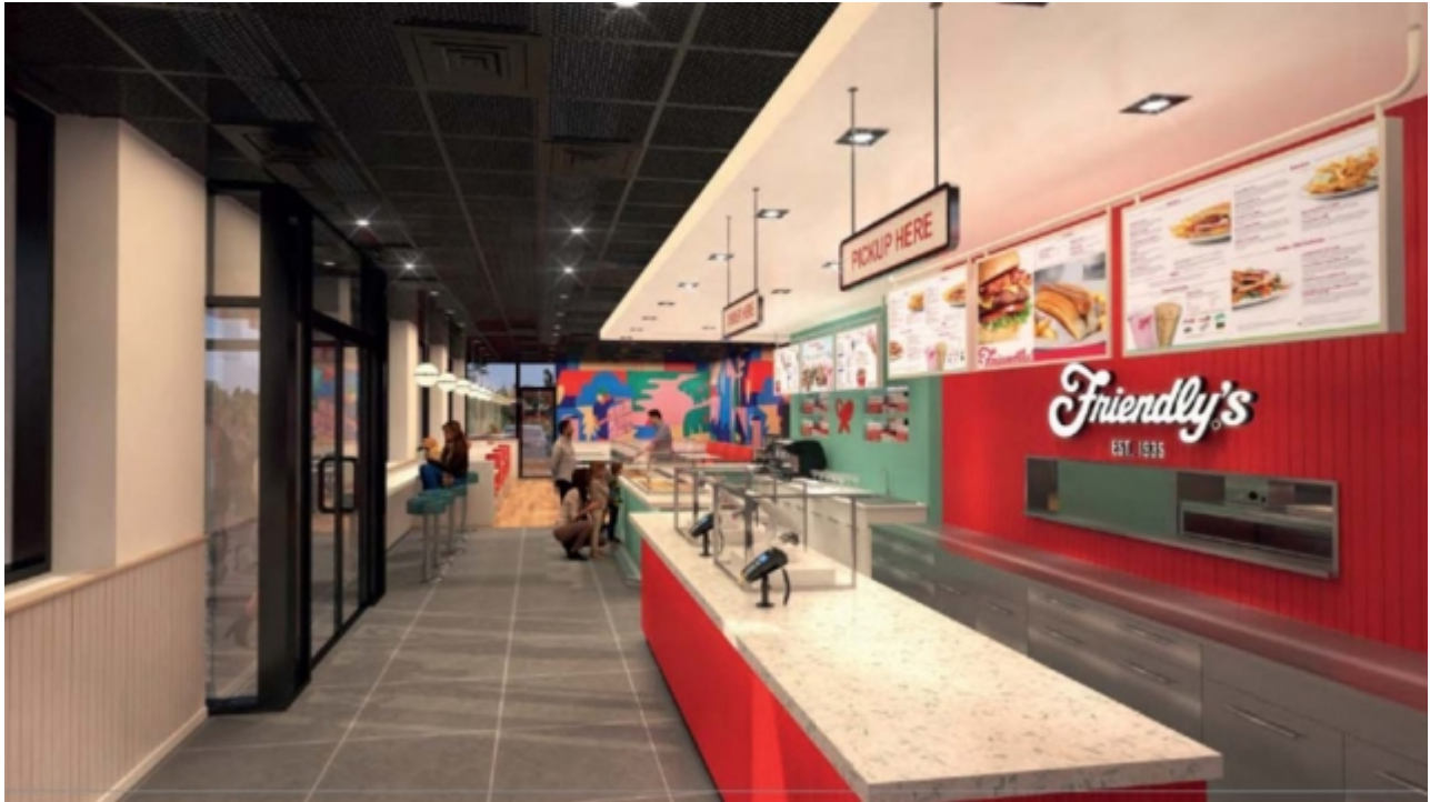
Friendly's Restaurant photo.

Currently, there are 137 Friendly's across New England, Delaware, Florida, Maryland, New Jersey, New York, Pennsylvania, and South Carolina.