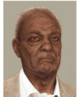
Photograph age progressed to 78 years old