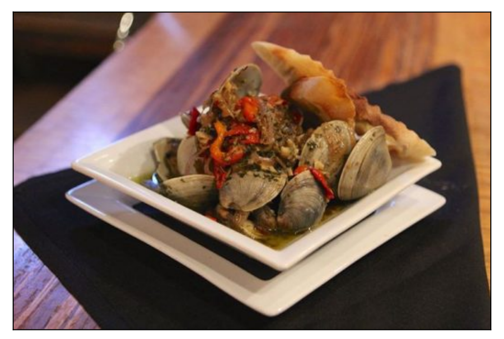
Don't stare too long. May induce drooling like a babe.

Cork has recently undergone rather large renovations, so if you haven't been in a while, you should revisit and see what they've done. If you have never been, you are missing out on something unique, original and special.