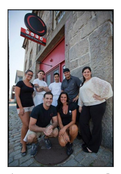
The people responsible for one of the area's best eateries.

a big fan of the abundancy philosophy when it comes to business and this clearly comes from the top from someone that practices this. Well done.