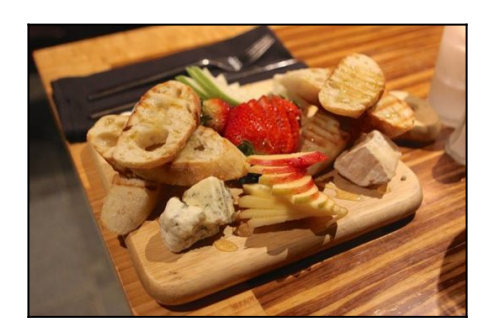
One of my favorite dishes EVER: Cheese platter: Blue cheese, New England Camembert,

Of course, there are many more tapas offerings on the menu which changes with the seasons, than I can mention. There are, of course, soup and desserts. Sticking with the theme of originality and terroir there is clam & corn chowder, wild mushroom & roasted garlic bisque (insanely good) and the delectable chorizo & sweet potato soup. In terms of dessert there is a flourless chocolate cake, Crème Brulee, sorbet and house-made cheesecake.