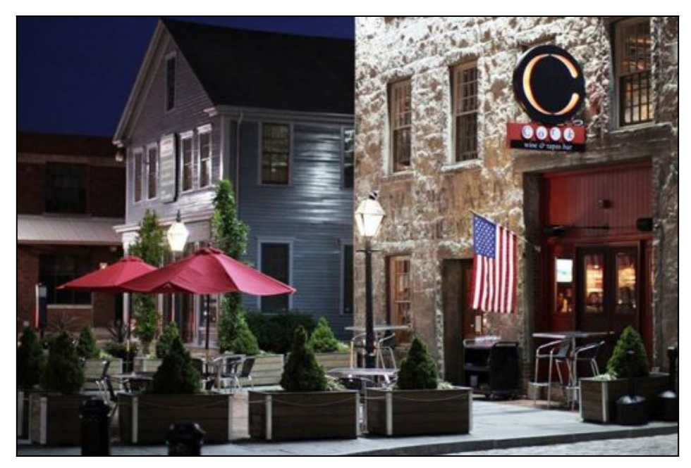
The gorgeous front of Cork's Joseph Taber building at 90 Front Street, built in 1836.

Being a foodie — OK, foodie junkie — one of my favorite aspects of writing is sharing some of the best eateries in the south coast, Massachusetts area. Nay, the planet — because we DO have some of the best restaurants on earth. I'm not talking about the "personal waitstaff a half dozen strong, you are served 18 thimble sized courses, and take out a small bank loan to pay for it. Oh, yeah — what was the food even like?" kind of place. I'm talking about places where food is the central focus and everything else revolves around it in a complimentary fashion.