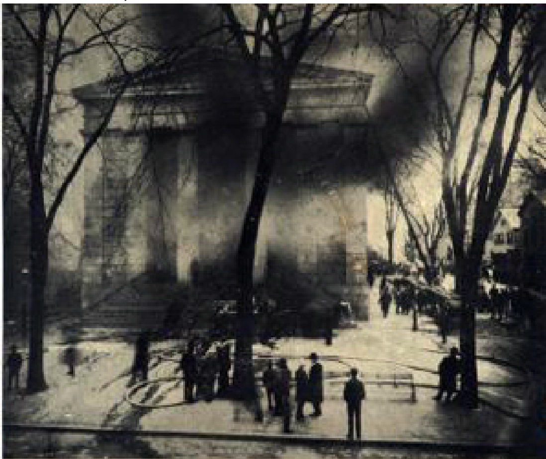
The New Bedford City Hall Building in 1910.