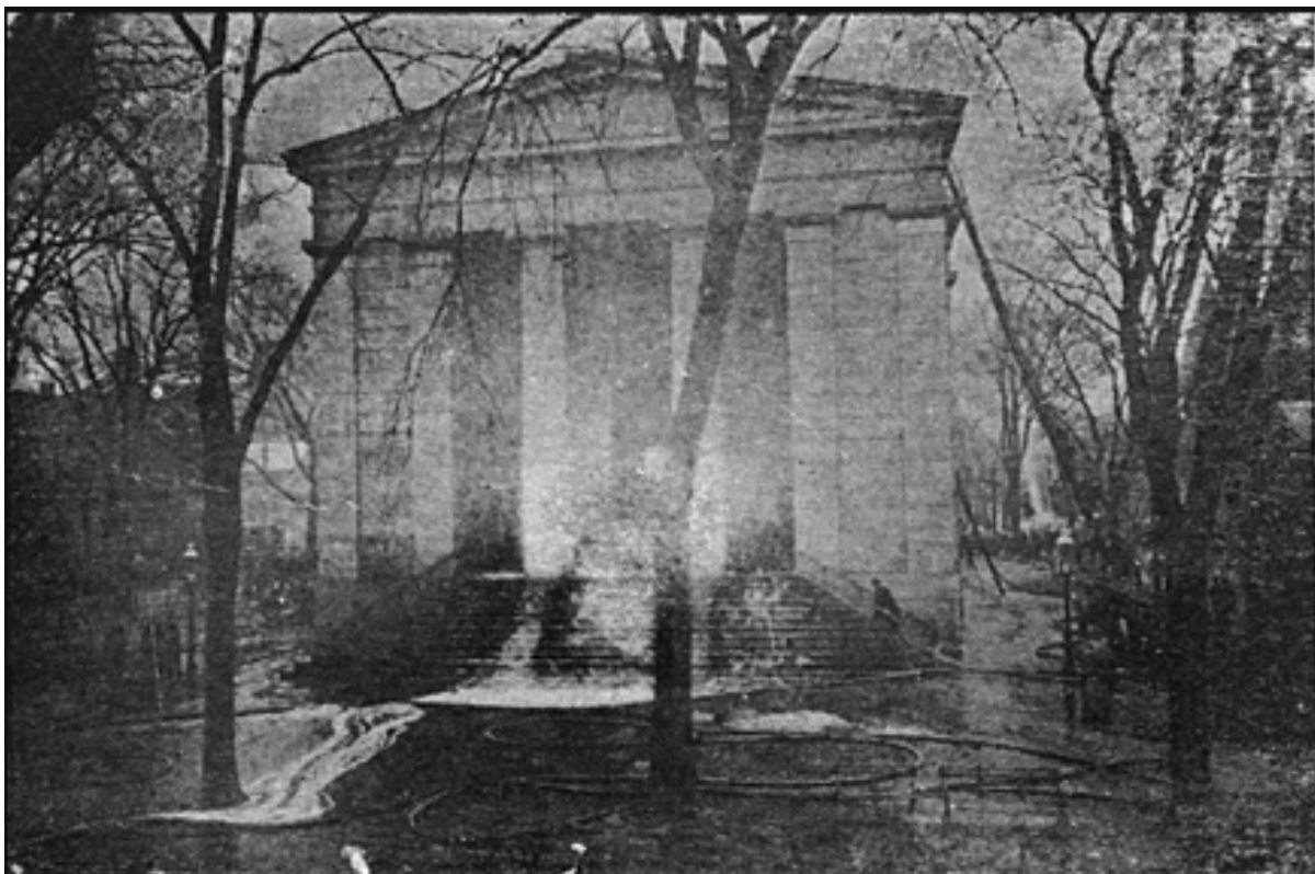
1906 Fire at the New Bedford City Hall (Spinner