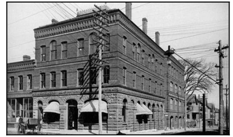
Very early photo showing horse-drawn carriages. Circa 1885.