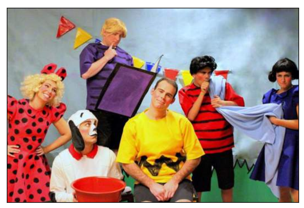
The talented cast of 'You're a Good Man, Charlie Brown'!

ONE Theater Group is proud to announce its upcoming production of "You're a Good Man, Charlie Brown." The show is fun and entertaining for all ages, but it also serves a very important purpose — all of the proceeds will be donated to the Alzheimer's Association.