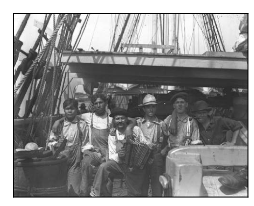
The unsung heroes of the Morgan — its crew! (Whaling Museum)