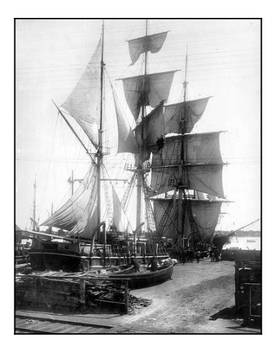
The Morgan docked in New Bedford

embedded her in the sand, then exhibited her.