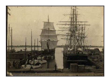
Gorgeous 19th century capture of the Morgan at New Bedford wharf

How about the 1,000 souls who worked as crew on the Morgan ? The scores of craftsmen that restored it? The docents that worked on it in an historic capacity? It has generated income for countless people whose families have benefited. It has put supper on the table, paid mortgages, developed bank accounts, or simply placed priceless smiles on thousands of faces. Imagine how many tens of thousands of people that this ship has affected by its existence!