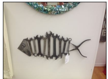
Repurposed items, refurbished, and re- loved.

In addition, you will find very affordable, handmade jewelry. Affordable, meaning affordable – not lip service. The jewelry ranges in price from $5-$30. Stunning, handmade, original pieces of jewelry. Lastly, in an attempt to maintain a variety, Repurpose Boutique has recently started branching out by offering handmade items offered by local craftsman – candles, beauty products and the ilk.