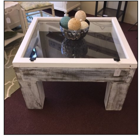
An example of a repurposed coffee table and window.

You won't find many of the things you encounter here anywhere else on planet earth. The interesting bit is that the vast majority of these items are repurposed – taking two or more items and combining them to produce something different, interesting, functional or appealing.