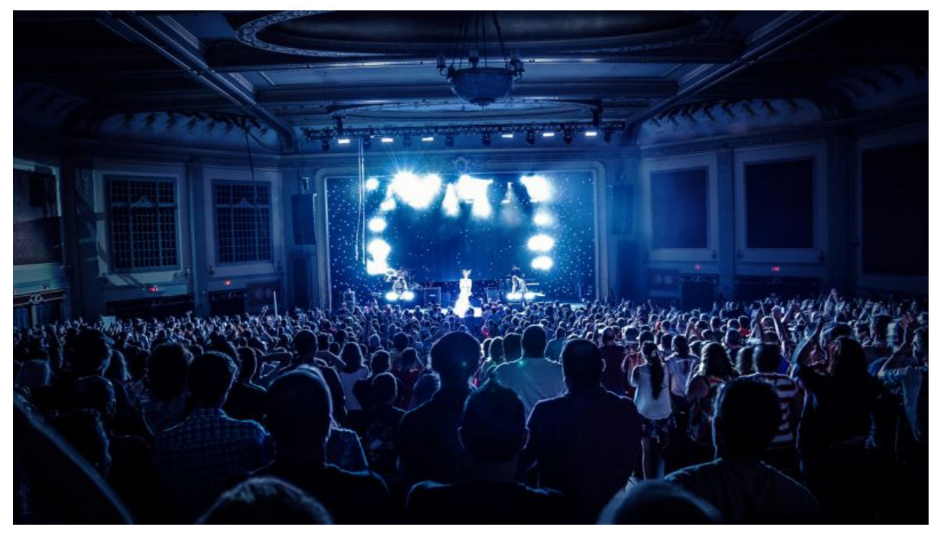
Zeiterion Theater photo.