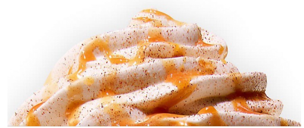
Dunkin Donuts photo.