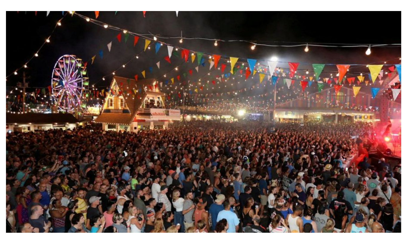
Feast of the Blessed Sacrament photo. 4. Culture & Diversity

New York and Boston markets, New Bedford became the wealthiest city in the world. This is because New Bedford became "The city that lit the world" or to put it bluntly, we have a history of men that would jump onto wooden ships with spears and hunt massive whales to light the world. One could say that is a pretty interesting and unique history we have!