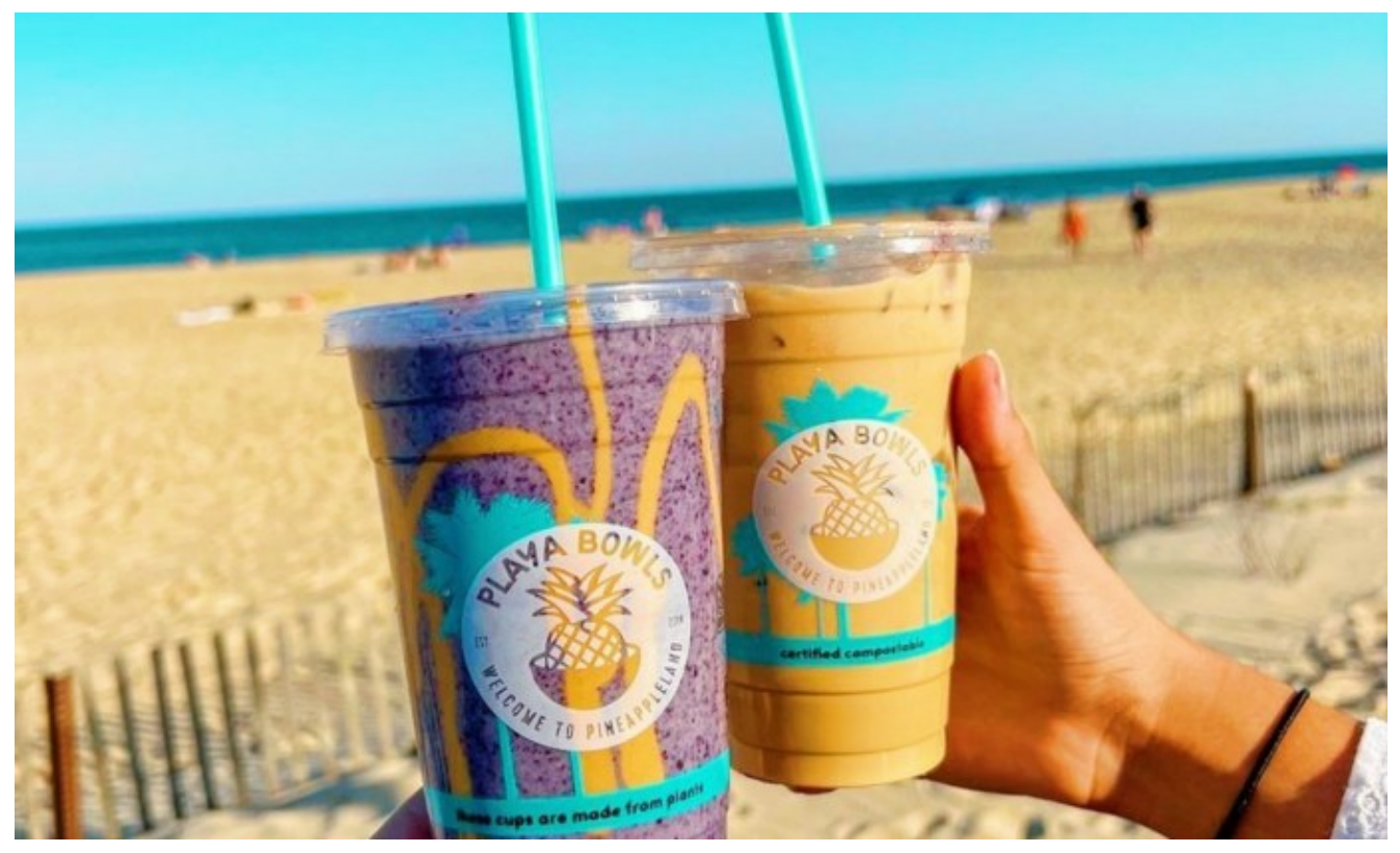
Playa Bowls Instagram photo.