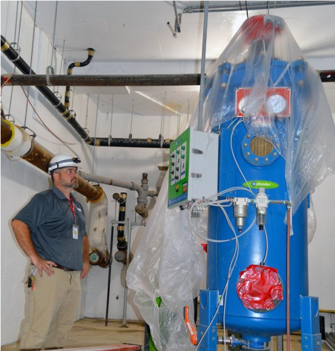
Pool renovations included state-of-the-art filtration, treatment, and temperature control systems.