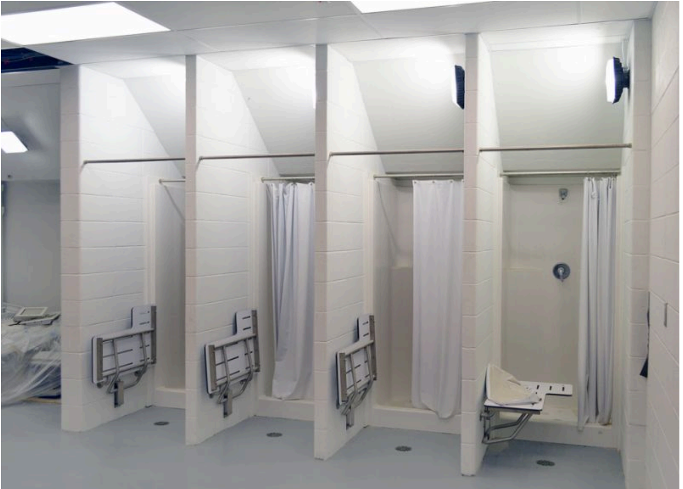
Adjoining locker and shower rooms were also fully renovated.