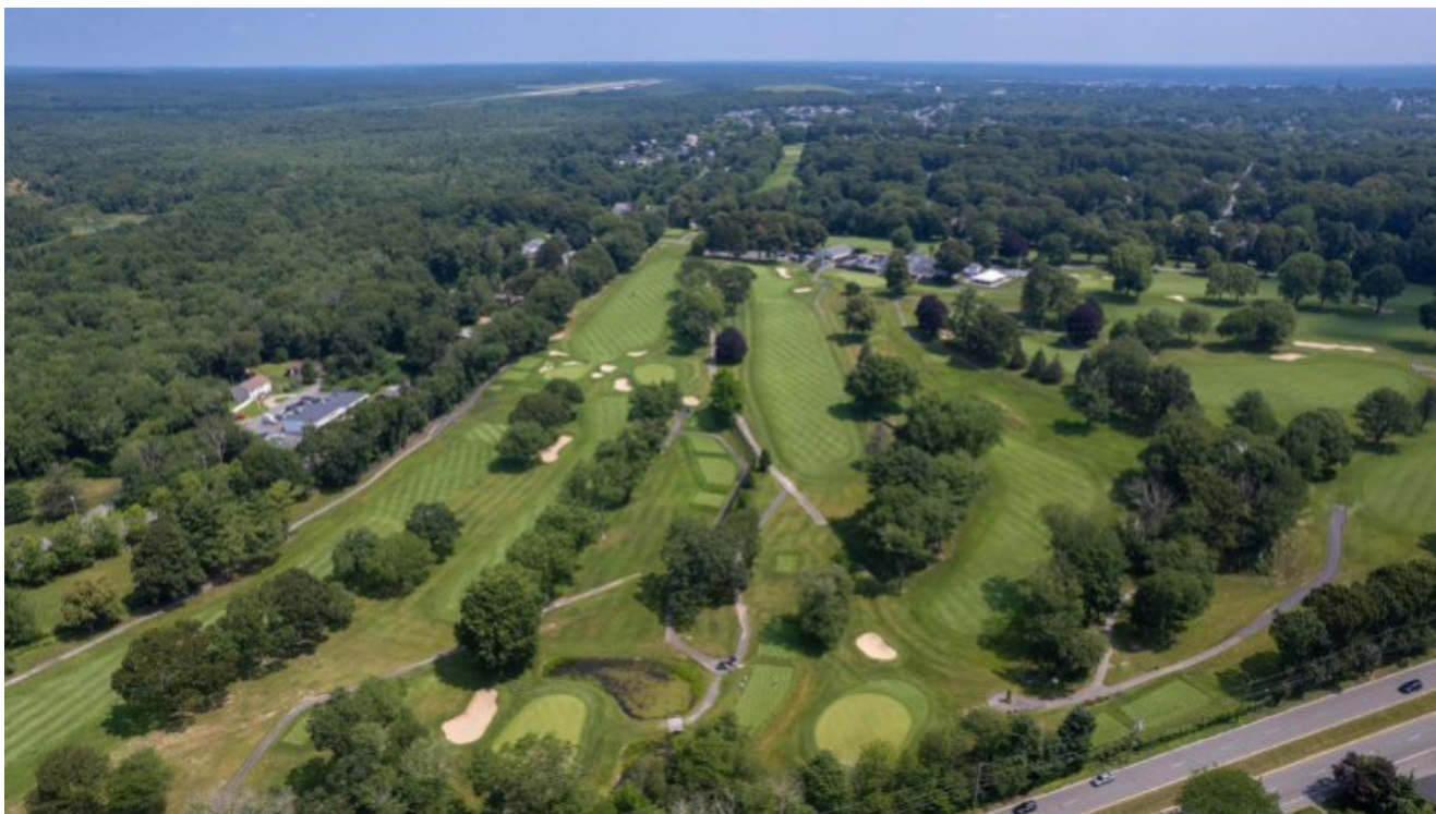
Country Club of New Bedford.

years and represent a wonderful example of a Willie Park Jr. design.