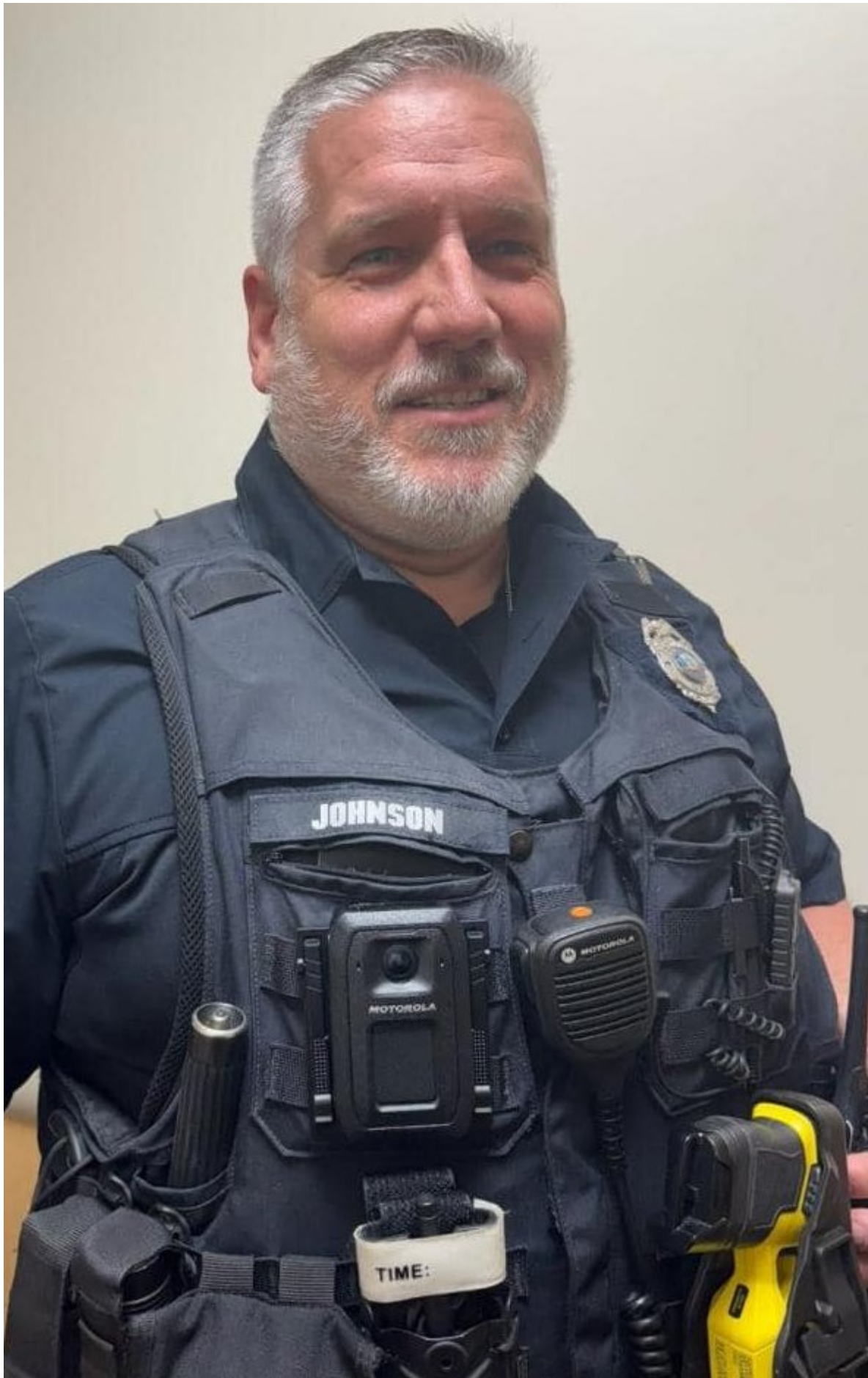
Marion Police Department photo.

All full-time Marion Police officers will be assigned a body-