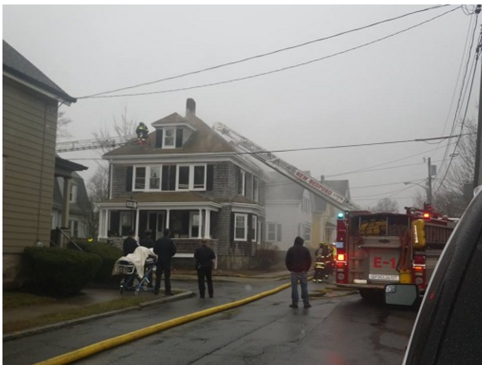
House fire on 55 Rounds Street in New Bedford.

New Bedford Police and Fire officials, State Police detectives assigned to this office, and prosecutors are currently investigating a fire-related death which occurred this morning in The City of New Bedford.