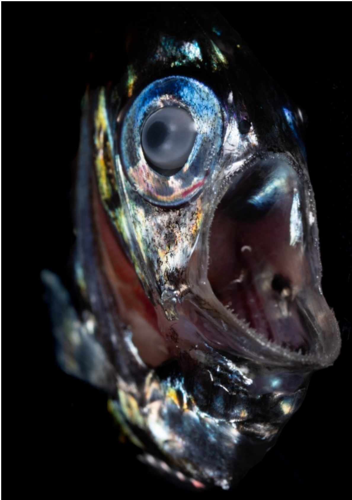
Transparent Sternoptyx diaphana.