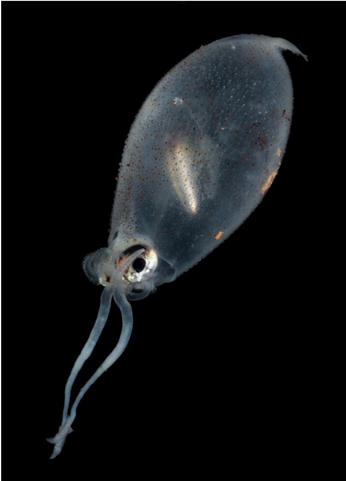
Glass Squid Cranchia scabra.

advance science and conservation management. His career in oceanography began at the Naval Academy where he earned a Bachelor of Science Degree in Oceanography.