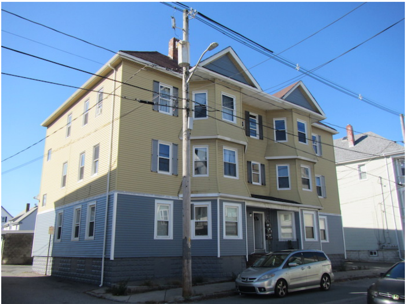
75 Crapo Street in New Bedford.