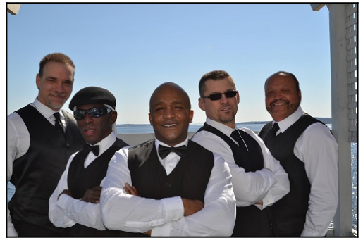
The Real Deal at Pub 6T5!