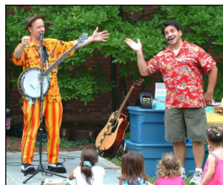
Everyone loves the Toe Jam Puppet Band!

The Strawberry Festival this year will also include a Craft Fair & Antique Car Show. Tour the grounds, historic buildings and enjoy a delicious strawberry shortcake with homemade biscuits & fresh whipped cream! Over a dozen local artists and craftspeople have signed up to sell unique handmade items at our craft fair – the shopping will be wonderful!